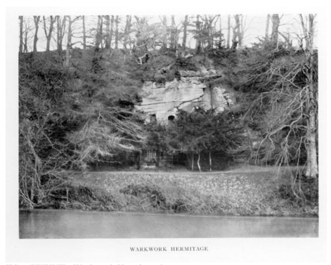
[Plate XXXVII : Warkwork Hermitage.]